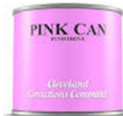
Pink Can Collection Box at the VCIG Office

If you have questions, anyone is more than welcome to come to the Committee Meeting, the first Thursday of every month in the Conference room above the VCIG Office at 6:30pm.