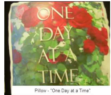
Pillow - "One Day at a Time"