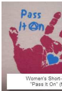
Women's Short-Sleeve "Pass It On" (front)