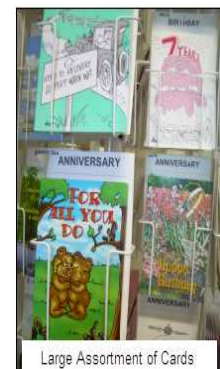
Large Assortment of Cards

When you buy from your local Intergroup, you support your local services. We have expanded our offerings and invite you to come in and check out the unique, collectible items we have for sale. You can pay by cash or check. Prices are subject to change. Thank for your patronage, suggestions