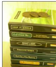
Large Assortment of Meditator Books and Medallions