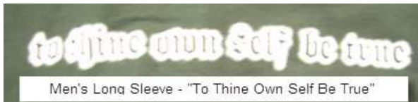
Men's Long Sleeve - "To Thine Own Self Be True"