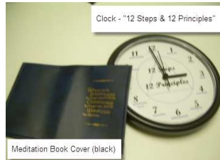
Clock - "12 Steps & 12 Principles"

New Items: Magnets, Pillows, Jewelry, and much more!