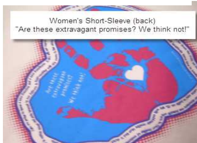
Women's Short-Sleeve (back) "Are these extravagant promises? We think not!"