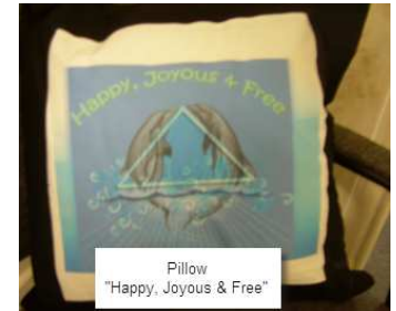
Pillow "Happy, Joyous & Free"